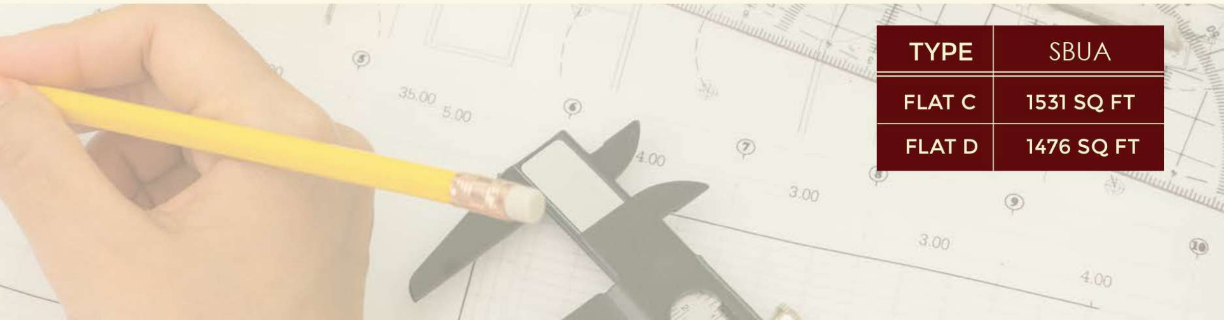
Flat Type D: 1476 Sq. Ft.